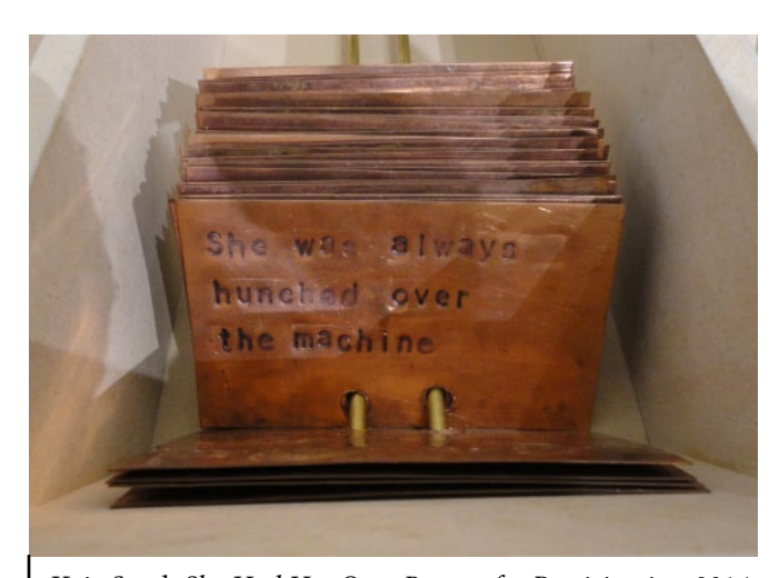
Kaia Sand: She Had Her Own Reason for Participating, 2014 Copper plates imprinted with steel type, sledgehammer, and alcohol-based ink. Language gathered from newspaper articles, activist materials, and surveillance reports all found in the files Portland Police kept on activists in the 1960s, 70s, and 80s.

collection. The residency itself is part of the public art project. The website is an extension (http://looseleafservices.us/), the book subscriptions, the exhibitions—all of it becomes portions of a whole. I like the idea of access, with works serving different purposes in the means of experiencing the objects. If I'm putting something online, I'm not necessarily emphasizing the materiality of these objects... However, you can go to an exhibition and see objects given to us by one of the people we've been working with, Lloyd Marbet, who was one of activists who was surveilled. You can go see a denim suit that was sewn by a friend of his for when he started to do these protests and become a self-anointed law