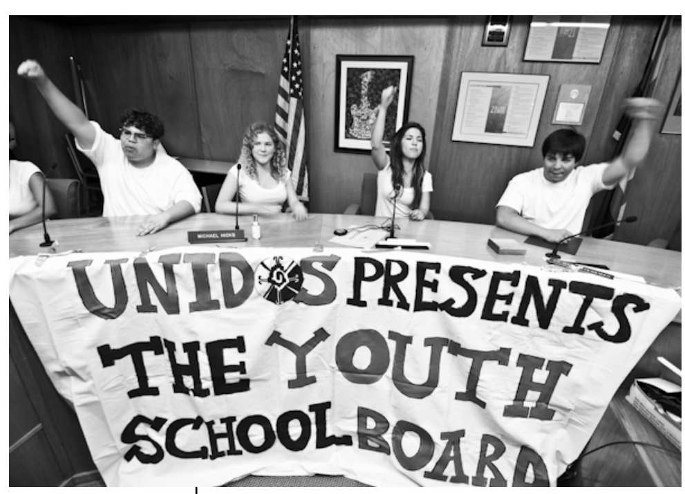
Student activists in Tuscon advocate for threatened multicultural and bilingual education programs.

First and bleeds... It's not a comfortable place to live in, this place of contradictions." The borderlands force us to come to grips with the inconsistencies in our